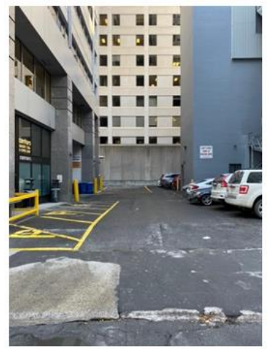
Picture 1: Picture from street of side of 255 Albert where loading dock is located.