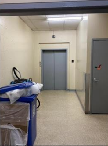
Picture 4: Picture from inside loading dock area Looking towards Freight elevator door