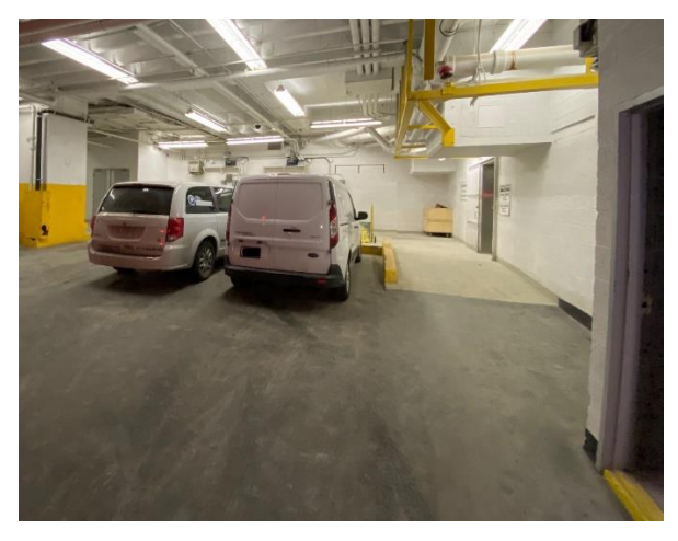
Photo 2: Photo taken from the loading dock door with a view of the inside of the loading dock area