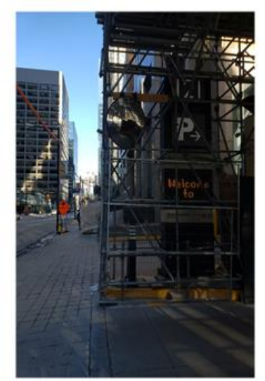
Picture 1: Picture from street of side of 121 King Street West where loading dock is located.