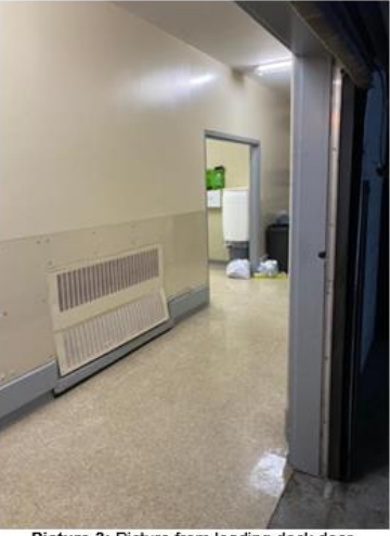
Picture 3: Picture from loading dock door looking inside loading dock area