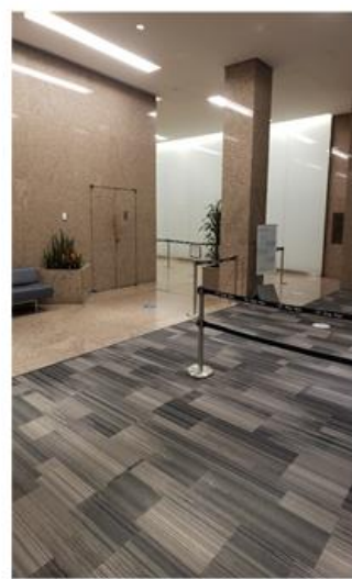
Picture 4: Picture from inside loading dock area Looking towards Freight elevator door