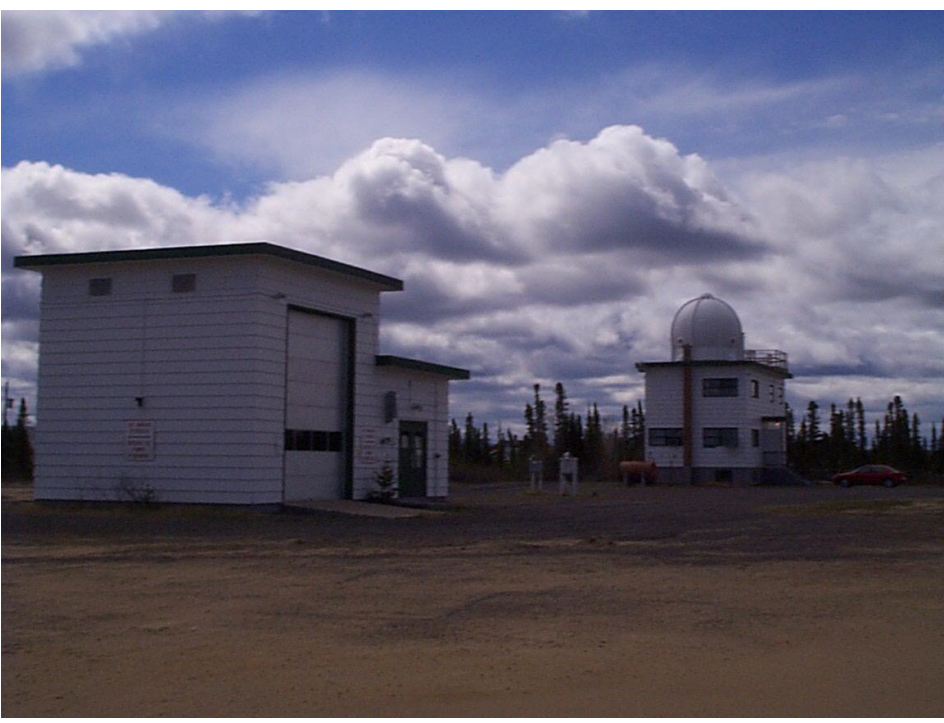
The Upper Air Weather Station – Operations Building (right) and the Hydrogen shed (left) where the balloon releases occur.