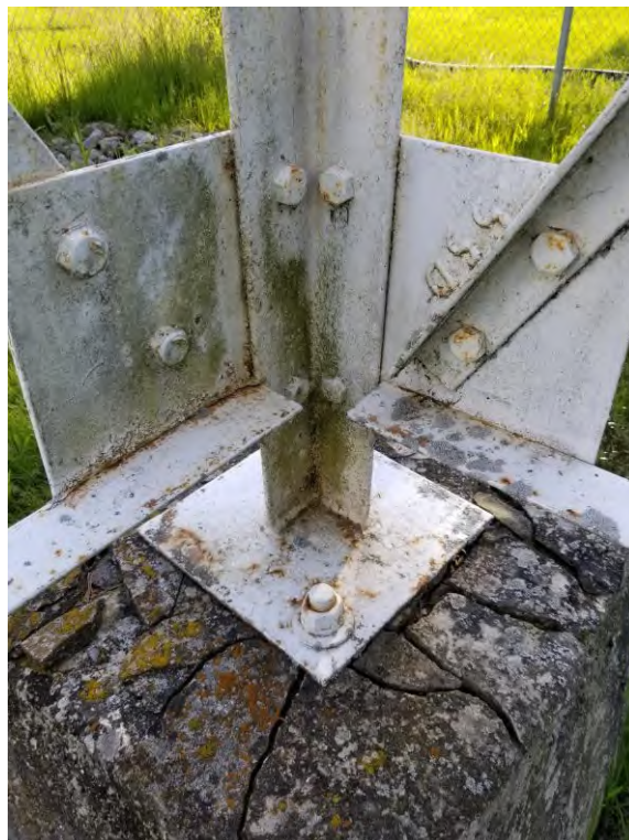
Figure 16: Existing LL488 Brighton Range Rear Concrete Footing