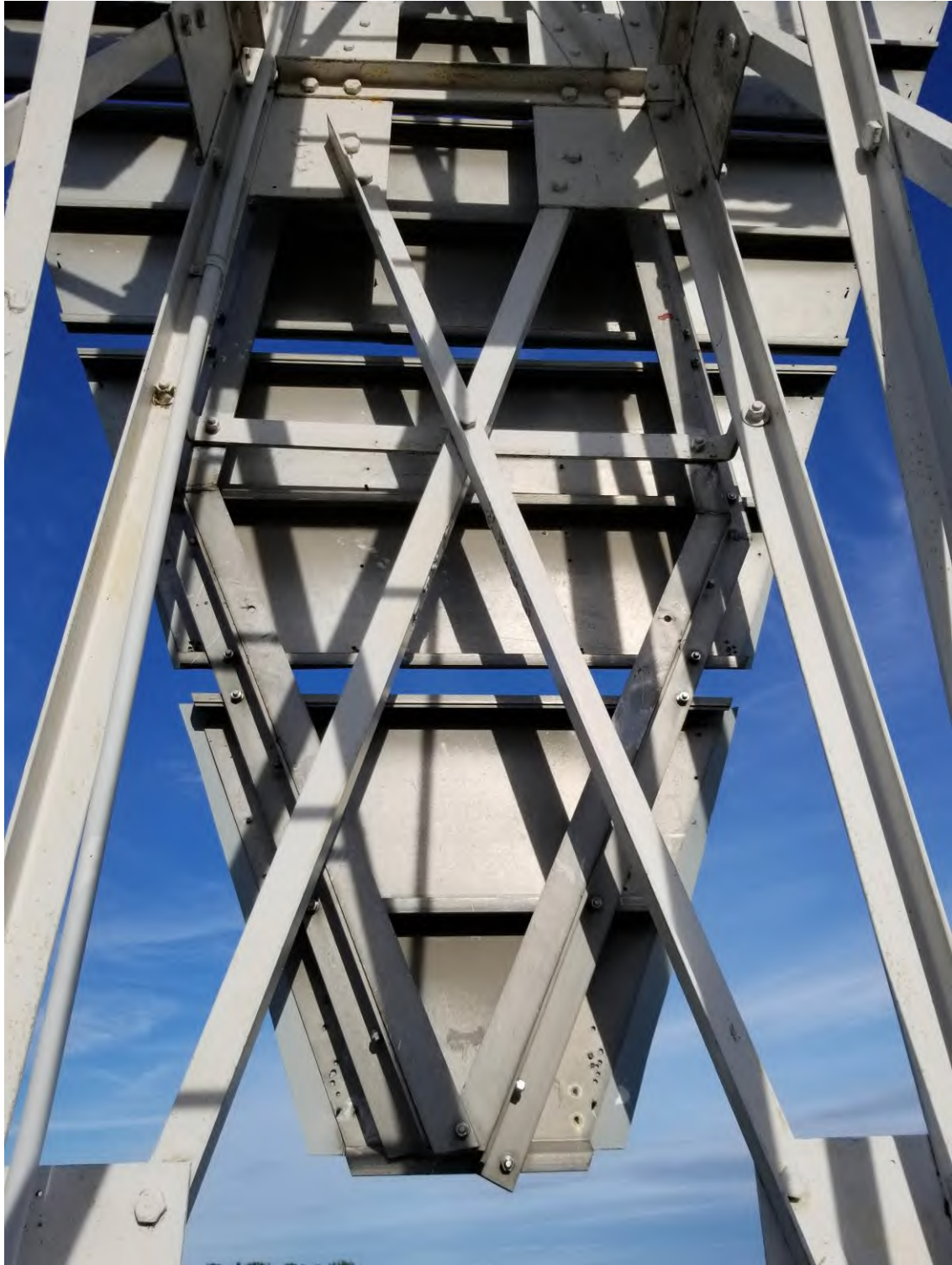
Figure 14: Existing LL488 Brighton Range Rear Daymark Assembly