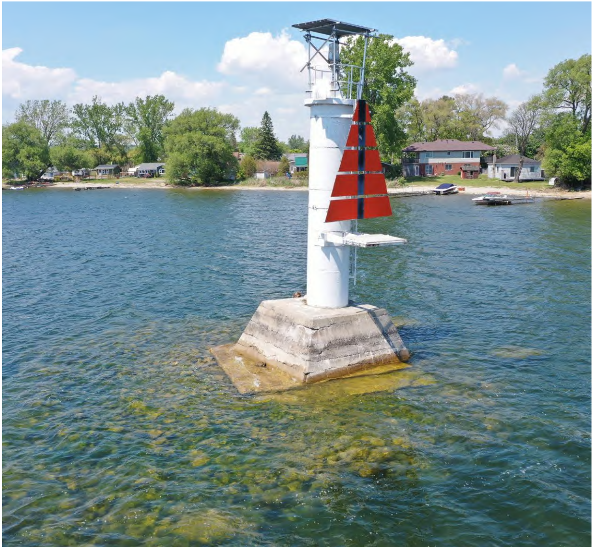
Figure 3: Existing LL487 Brighton Range Front