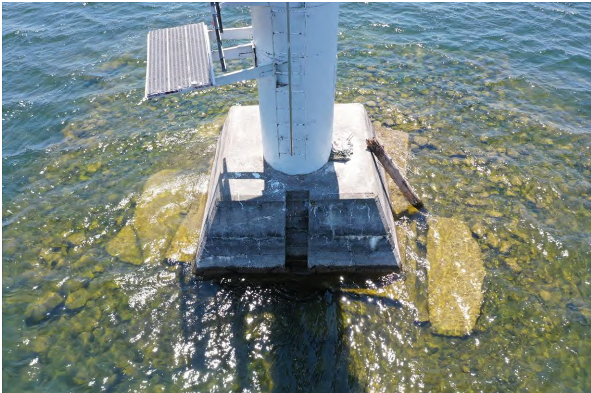
Figure 5: Existing LL487 Brighton Range Front – Facing South