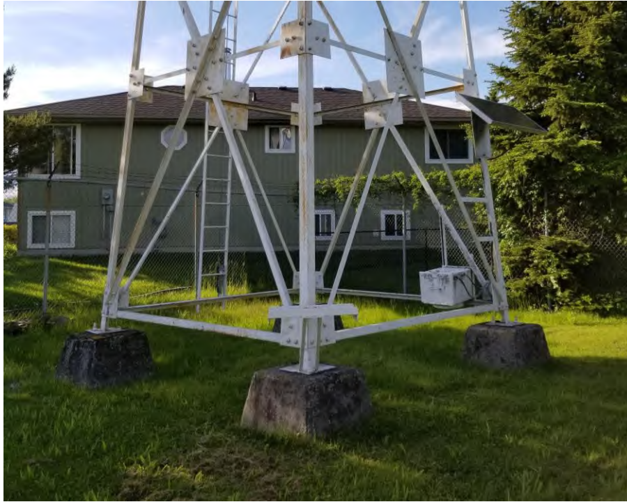
Figure 15: Existing LL488 Brighton Range Rear Bottom