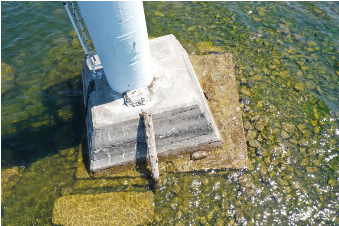
Figure 7: Existing LL487 Brighton Range Front – Facing East