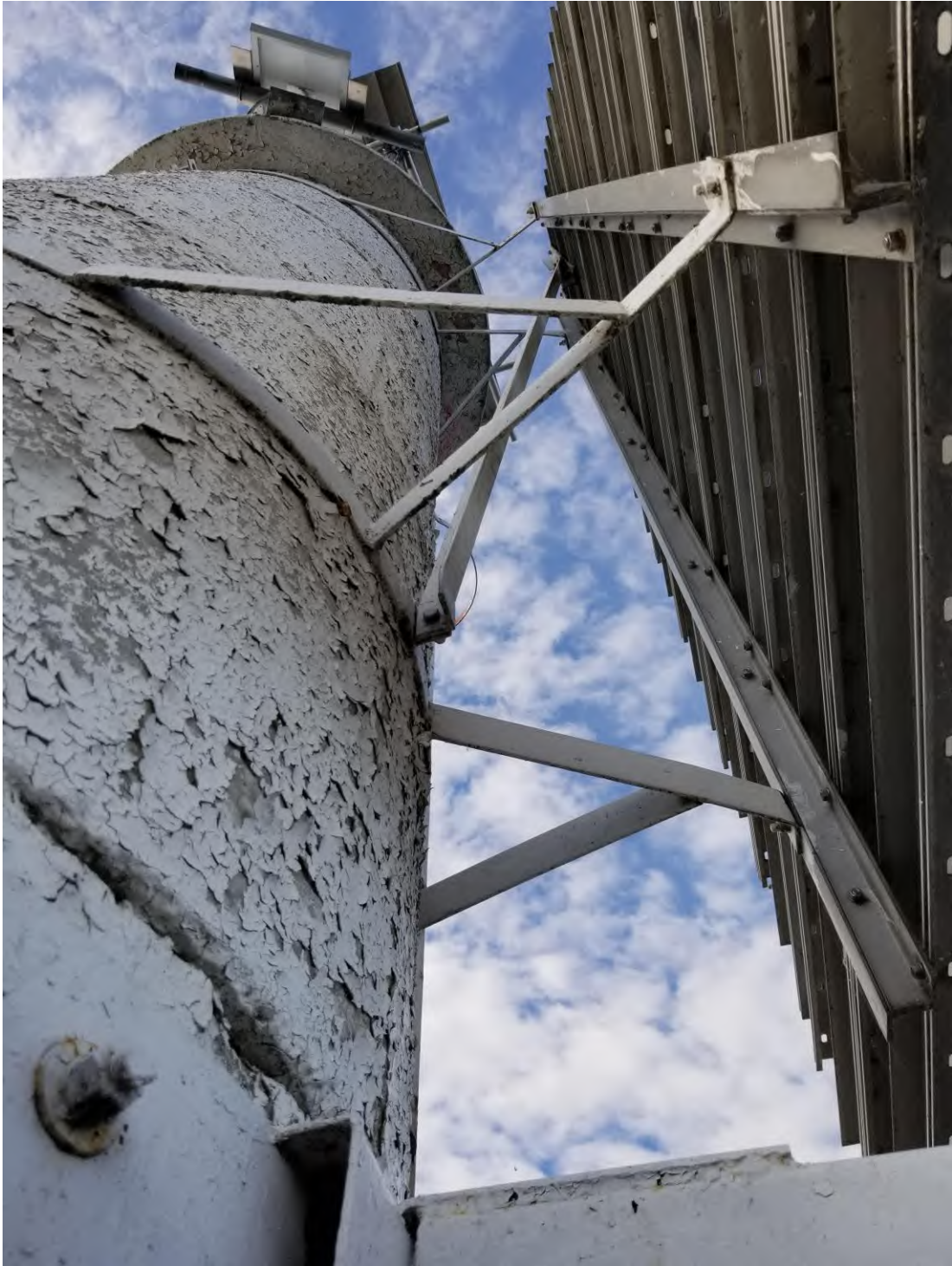
Figure 10: Existing LL487 Brighton Range Front Daymark Assembly