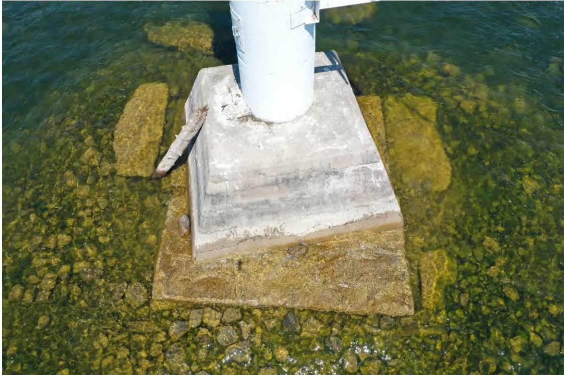
Figure 8: Existing LL487 Brighton Range Front – Facing North