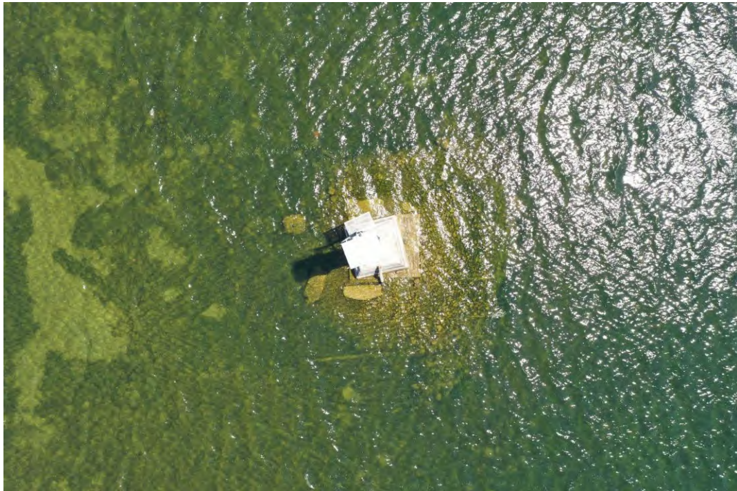
Figure 9: Existing LL487 Brighton Range Front – Overhead