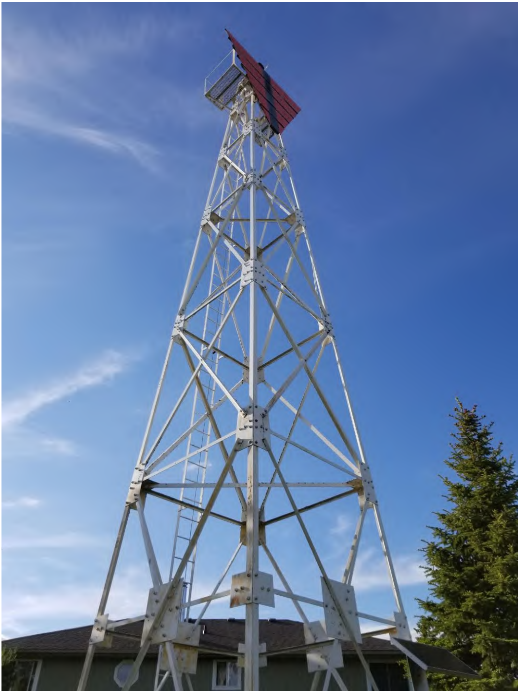
Figure 13: Existing LL488 Brighton Range Rear from Below