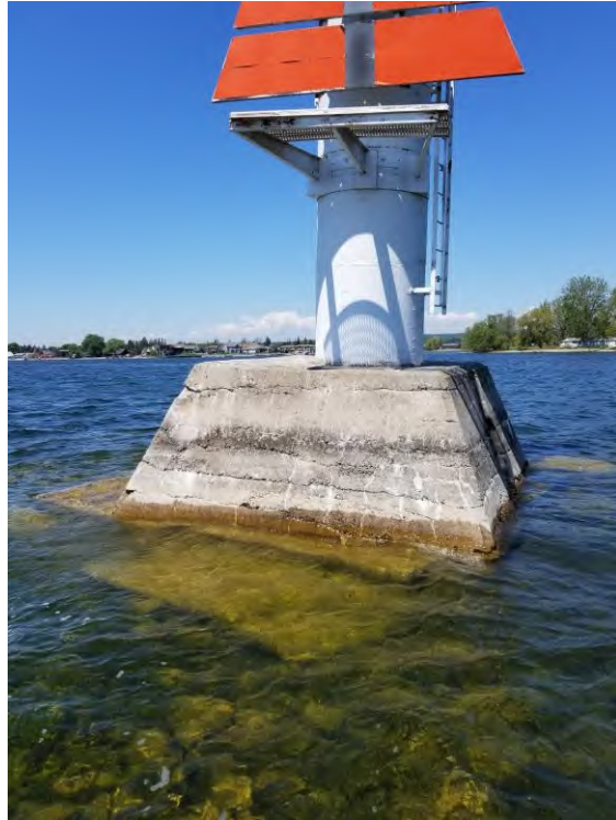
Figure 4: Existing LL487 Brighton Range Front – Facing West from Water Level