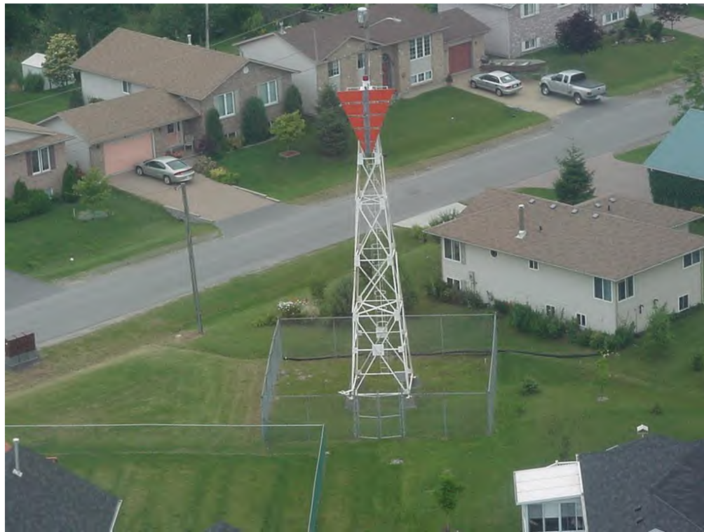
Figure 12: Existing LL488 Brighton Range Rear