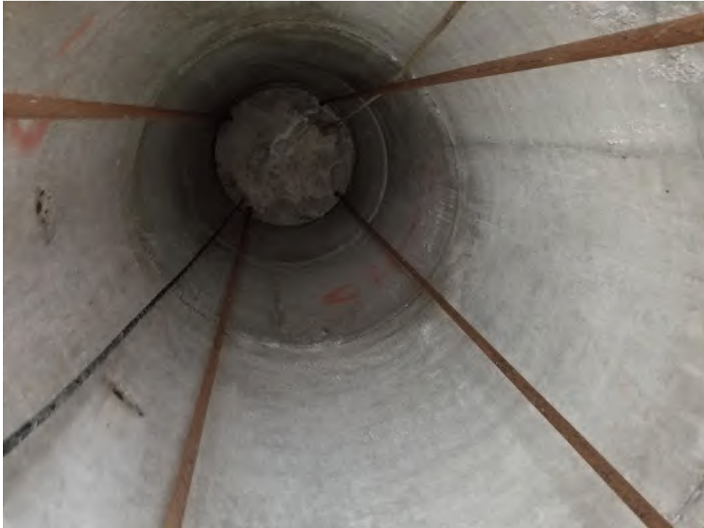
Figure 11: Existing LL487 Brighton Range Front – Interior