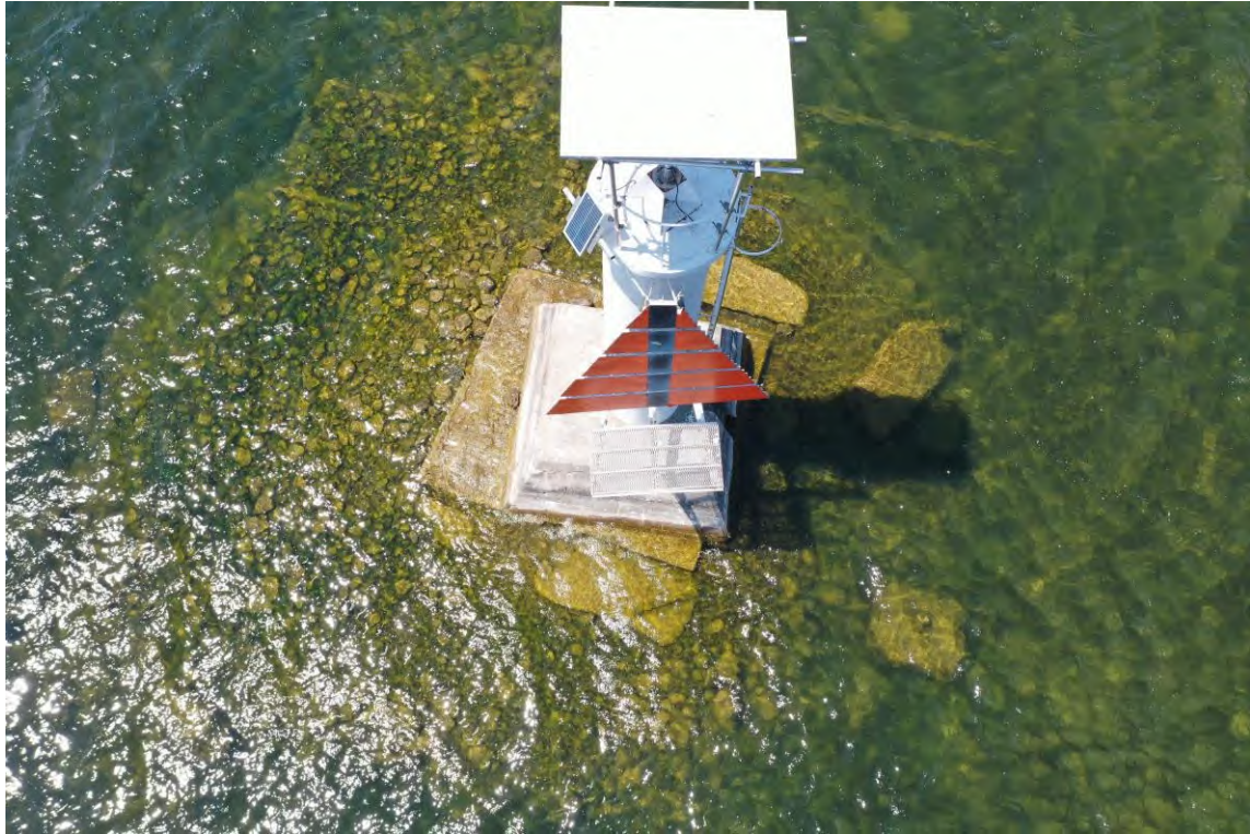
Figure 6: Existing LL487 Brighton Range Front – Facing West from Above