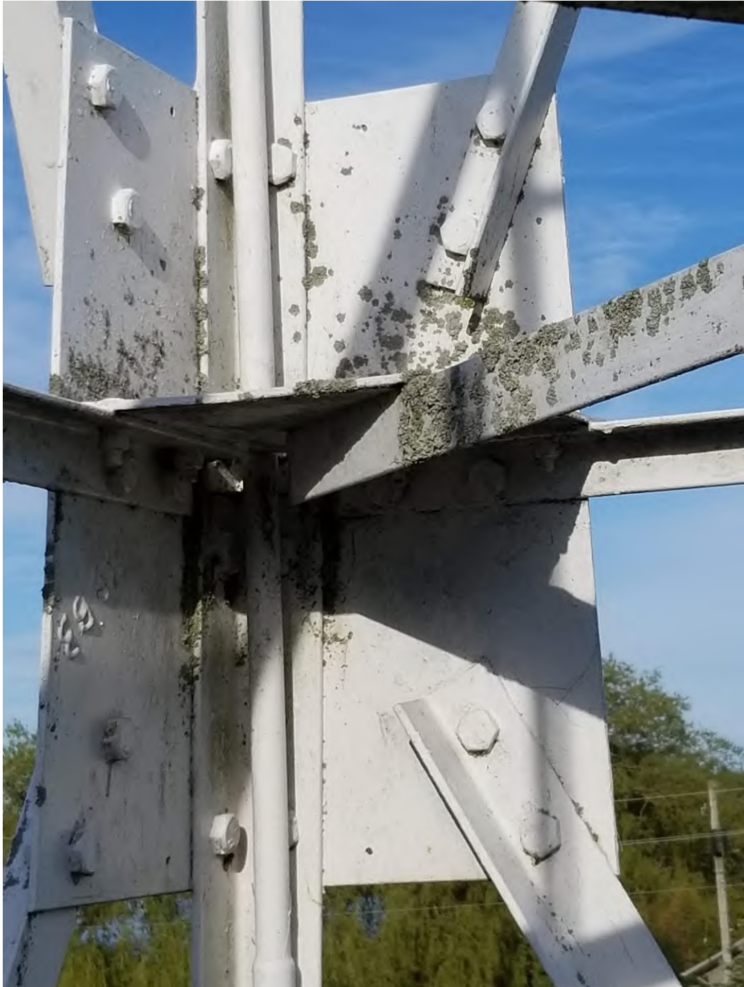
Figure 17: Existing LL488 Brighton Range Rear Member Connection