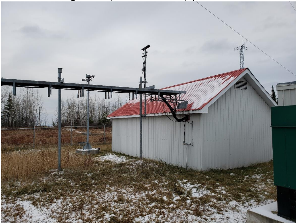
Figure 4: Existing building showing cable tray and pipemast Tower