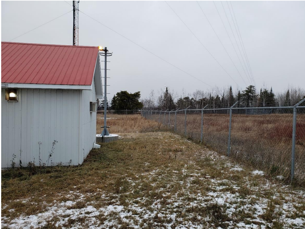
Figure 5: Existing site conditions of East Side of existing building and pipemast tower