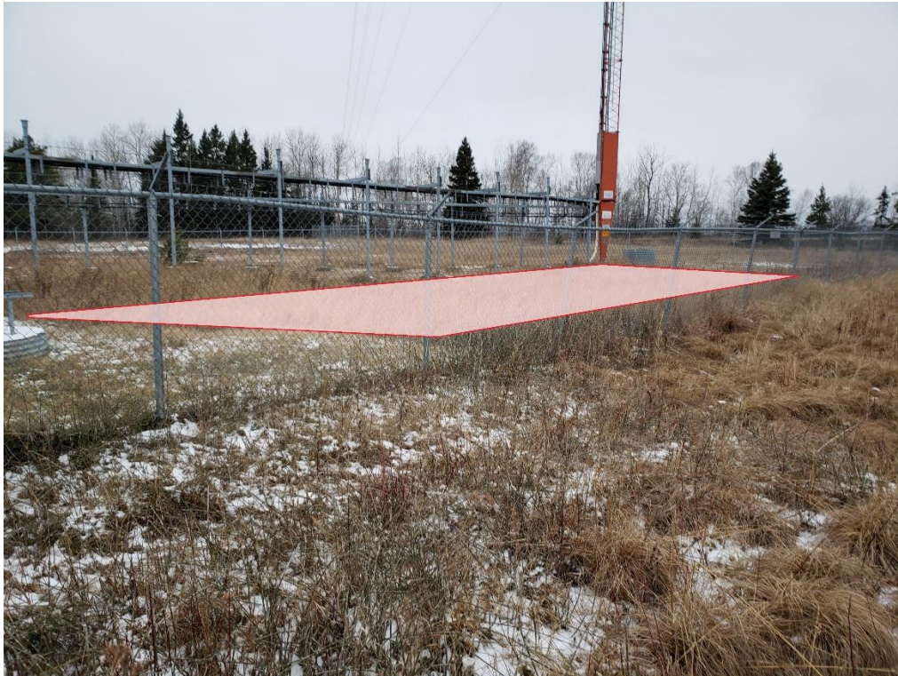
Figure 3: Proposed area for new equipment trailer