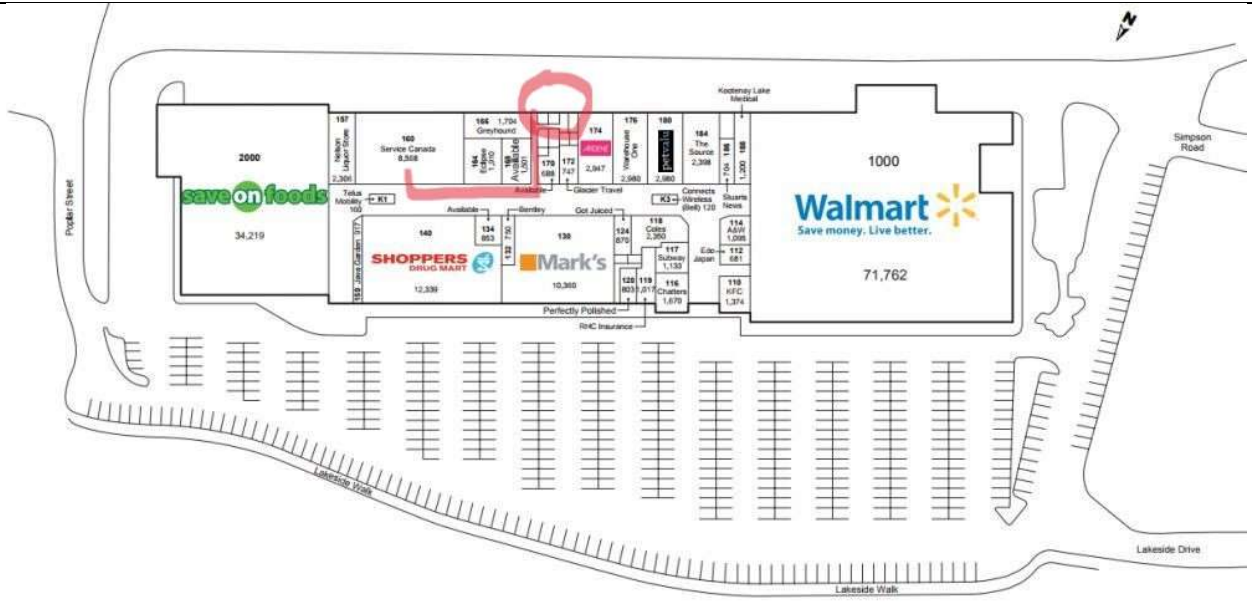
Back of Mall (SaveOnFoods side)