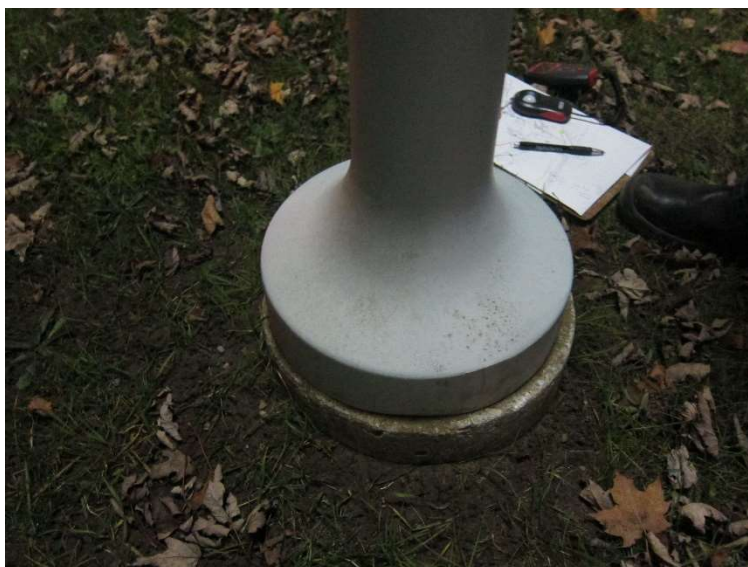
Typical Existing Yard Lighting Base