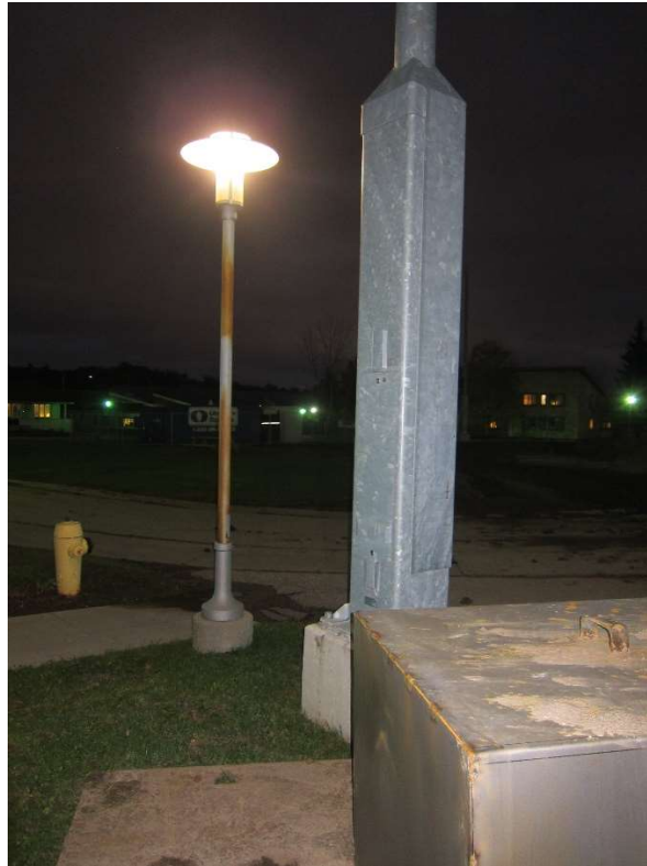
Typical Existing Yard Lighting Pole & Luminaire

The following survey photos are meant to provide bidders with a limited visual of existing conditions. The photos are not meant to outline all details related to the scope of work, and will not form part of the Contract Documents.