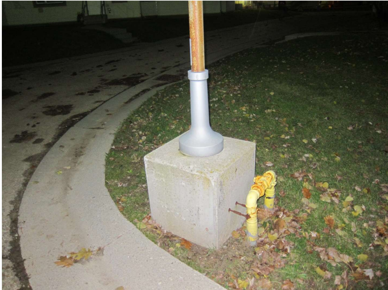
Existing Pole Base at Natural Gas Valve