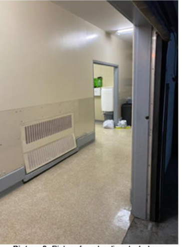
Picture 3: Picture from loading dock door looking inside loading dock area