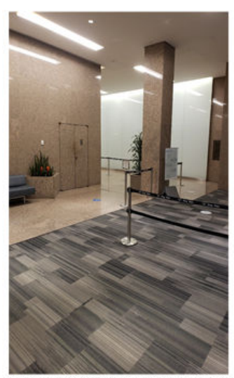
Picture 4: Picture from inside loading dock area Looking towards Freight elevator door