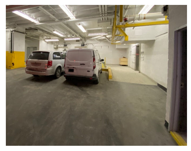
Photo 2: Photo taken from the loading dock door with a view of the inside of the loading dock area