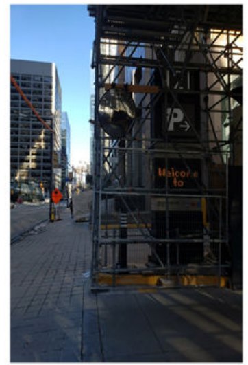
Picture 1: Picture from street of side of 121 King Street West where loading dock is located.