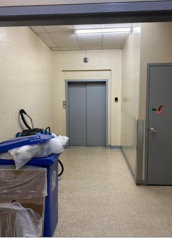
Picture 4: Picture from inside loading dock area Looking towards Freight elevator door