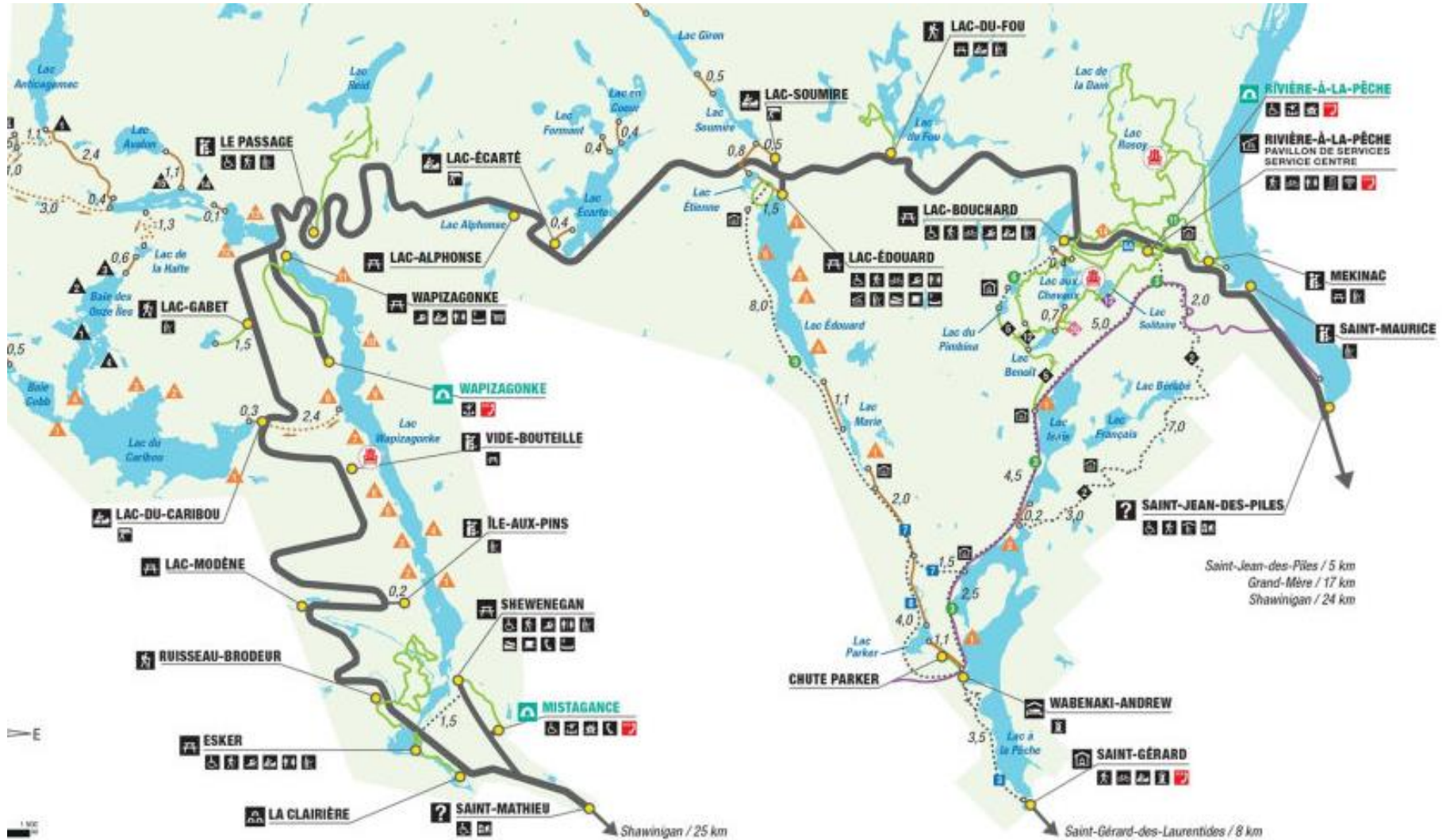
Figure 1 – General map – La Mauricie National Park